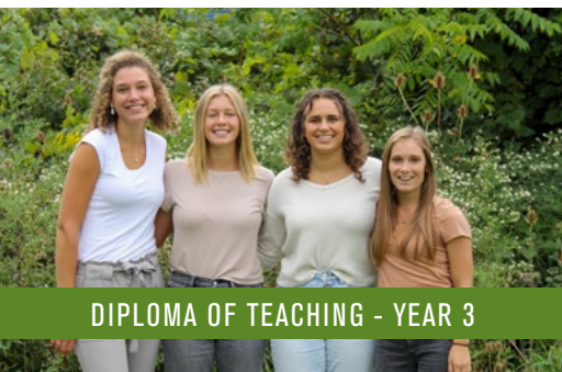
DIPLOMA OF TEACHING - YEAR 3

Each one should use whatever gift he has received to serve others, faithfully administering God's grace in its various forms." 1 PETER 4:10