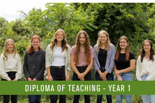
DIPLOMA OF TEACHING - YEAR 1