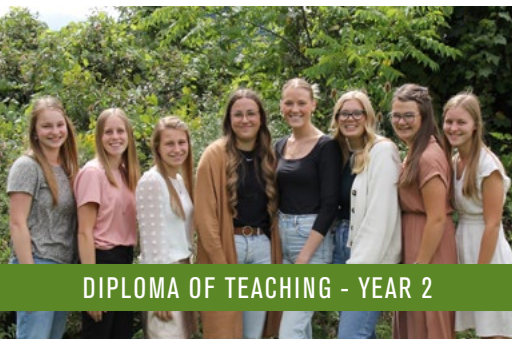
DIPLOMA OF TEACHING - YEAR 2