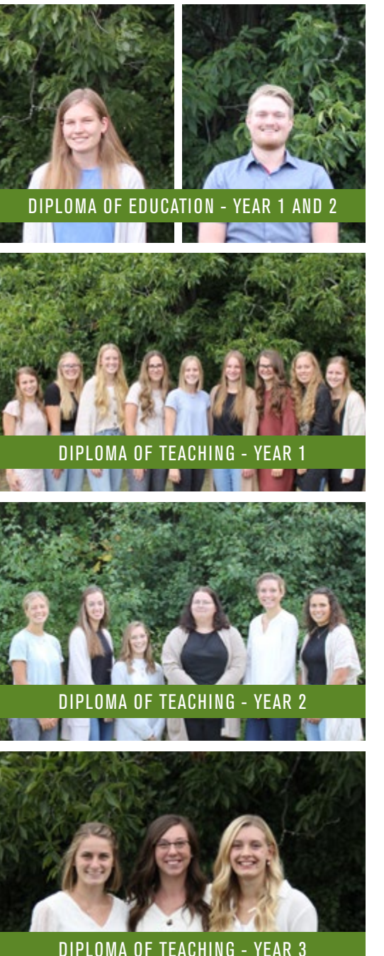
DIPLUMA UF TEACHING - YEAR 3

One of the extra-special moments of any given day at Covenant Canadian Reformed Teachers College (CCRTC) is when students, staff, and faculty are together in the library, eager and ready to begin a new day of learning and teaching. Opening devotions are characterized by the reading from God's Word, singing praises to his great Name, and bringing our adoration, joys, and requests before his throne. The first day of the 2022-2023 academic year formed no exception. Together we considered the words of Psalm 145 as they apply to the education of God's covenant children. It is a text that brings home the importance of training future teachers to be faithful in their calling of telling the next generation of God's work and Word. We paid attention to the beautiful task of teaching as speaking of, meditating on, celebrating, and telling of God's awesome works. And we saw the comfort in doing so while seeking the blessings of our God who is faithful, loving, and righteous and who upholds, lifts up, listens, and watches. It was a privilege to begin the new year in this way and it enabled returning and new students, staff, and faculty members to focus on our shared God-given task.